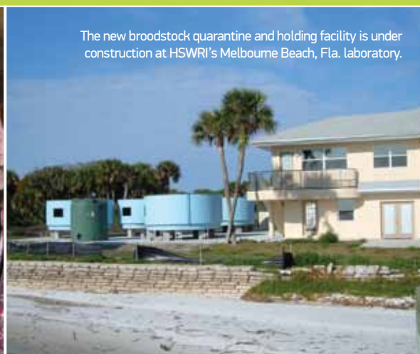
The new broodstock quarantine and holding facility is under construction at HSWRI's Melbourne Beach, Fla. laboratory.