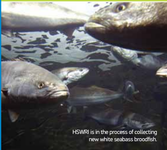
HSWRI is in the process of collecting new white seabass broodfish.